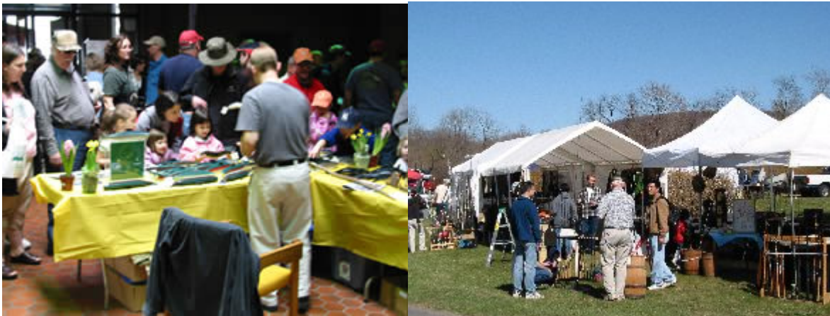
Displays and exhibits await indoors

This event is great for people of all ages and there are so many things to see and do throughout the day. This year's Open House will be March 27 and 28 from 10:00 - 4:00 daily, so plan to join us as we celebrate the beginning of trout season and spring. Bring your families, friends, scout troops, church groups, fishing clubs and anyone else for a fun time in the outdoors.